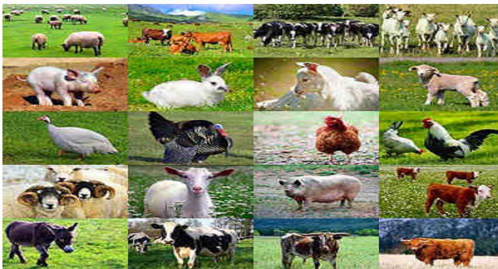
Figure 3: Show differences possible in livestock breeds and species over time and space HOW POPULATION GENETICS PLAY ROLE IN CONSERVING FARM ANIMALS

Conservation of animal genetic resources for food and agriculture (AnGR) may be undertaken for a number of reasons (FAO, 2012). In developed countries, traditions and cultural values are important driving forces in the conservation of risk breeds and the emergence of niche Markets for livestock products. However, in developing countries the immediate concerns are food security and economic development. Allendorf et al., 2006 and Avise, 2004 stated that conservation genetics is an interdisciplinary science that aims to apply genetic methods to conservation and restoration of biodiversity. Interdisciplinary of conservation genetics is based on the interaction of several field including population genetics, molecular ecology, biology, evolutionary biology, and systematic, Genetic diversity is one of the three fundamental levels of biodiversity with direct impact on conservation of species and ecosystem biodiversity. According Kefyalew, 2013, conservation of animal resources should ideally be undertaken at global level, because of the existence of non- and trans-boundary breeds. However, national conservation programs better serve specific local Interests, such as conservation with the objectives of improving indigenous breeds. There are obviously many reasons why genetic conservation should be considered, e.g. cultural, historic, and scientific interests and on the one hand for more practical and economic considerations.